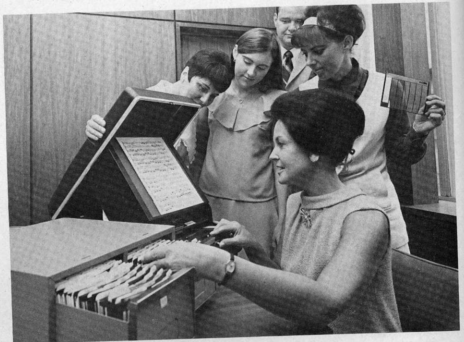
This group is viewing MUSIcache. The portable Bell & Howell microfiche reader displays a page from a musical score. In the miniature tray are over 1,000 microfiche, representing over 95,000 pages of material.